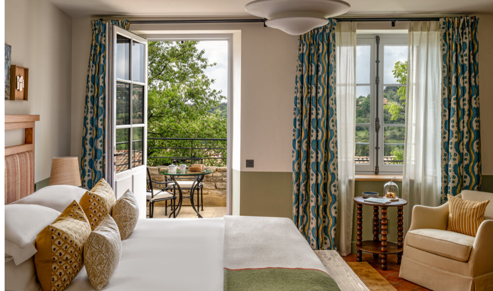
A room at Hotel Crillon le Brave, with curtains from Antoinette Poisson featuring an 18th-century-inspired block printed floral pattern.