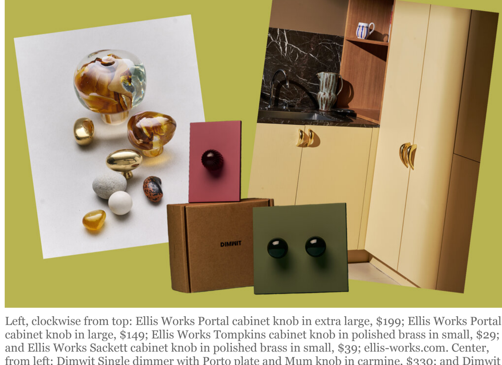
Left, clockwise from top: Ellis Works Portal cabinet knob in extra large, $199; Ellis Works Portal cabinet knob in large, $149; Ellis Works Tompkins cabinet knob in polished brass in small, $29; and Ellis Works Sackett cabinet knob in polished brass in small, $39; ellis-works.com. Center, from left: Dimwit Single dimmer with Porto plate and Mum knob in carmine, $330; and Dimwit double dimmer with Muir plate and Dot knobs in moss, $485; dimwit.world. Right, from left: Petra Barbara pull in small, $120; and Petra Barbara pull in large, $195; petrahardware.com.